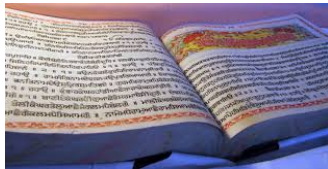
Guru Granth Sahib (holy book)