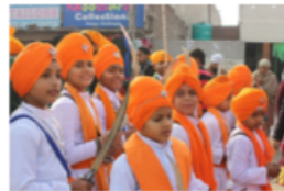
Khalsa the Sikh community, of baptised Sikhs