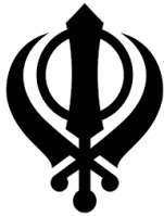
khanda (emblem of Sikhism)