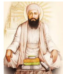
guru (spiritual teacher)