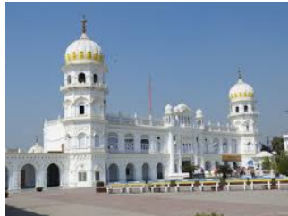
Gurdwara (place of worship)