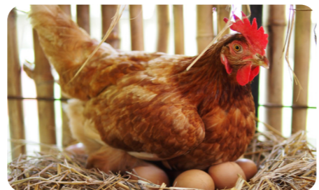
eggs from chickens

Some other foods also come from animals.