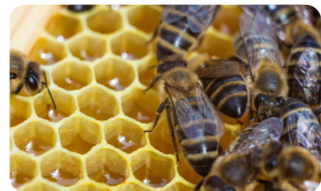
honey from bees