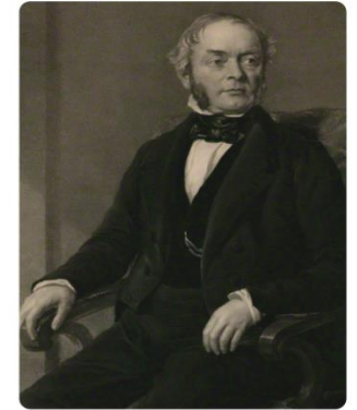
Samuel Wilderspin (1791–1866)

Samuel Wilderspin was a significant teacher whose ideas changed infant education. He thought learning should be explained properly and that children should be happy at school and be able to play and sing. He invented the school playground.